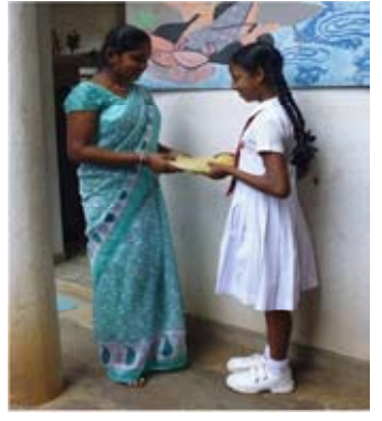
The Modara social worker handing over educational equipment to a student.

culties to continue their education with regular attendance. (Therefore to overcome these difficulties faced by the children, the social workers based at the centres identified the needs of these children in providing them with school related equipment.) The shoes were a major source of financial difficulty as it was beyond the financial means of the parents