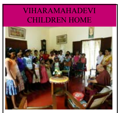
The Rahula Trust spent £3237.00 to conduct additional tuition classes in Maths, Science, English, Music and Dance at the Viharamahadevi Children's home. The management of the home wrote to us that children have benefited tremendously from this help and 2 students have passed their A/L examination last year with excellent results and 5 students are waiting for their results this year.

SERVE said, "We would wish to express our sincere gratitude to the Rahula Trust for the kind and generous gesture in coming forward especially at a time when SERVE was in need of urgent support to meet this basic need, in order to fulfill their right to education. This will thus ensure and help the children to enjoy the free education facility provided by the Government and continuity of their education."