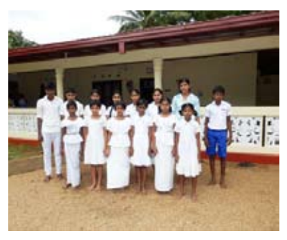
Sponsored children in Padavi-Sri Pura